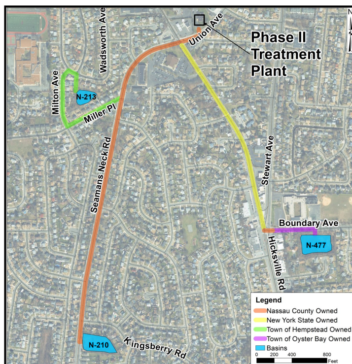
Figure 2– Drilling and Construction Areas

RE108 Phase II Treatment will intercept contaminated groundwater not captured by Phase I and will include: