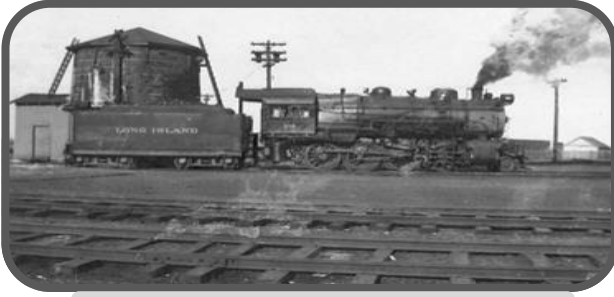
Long Island Railroad Steam Engine

The courthouse referendum indicates the important role the railroad played in local growth. By the end of the Civil War in 1865, tracks ran along the center, and the north and south