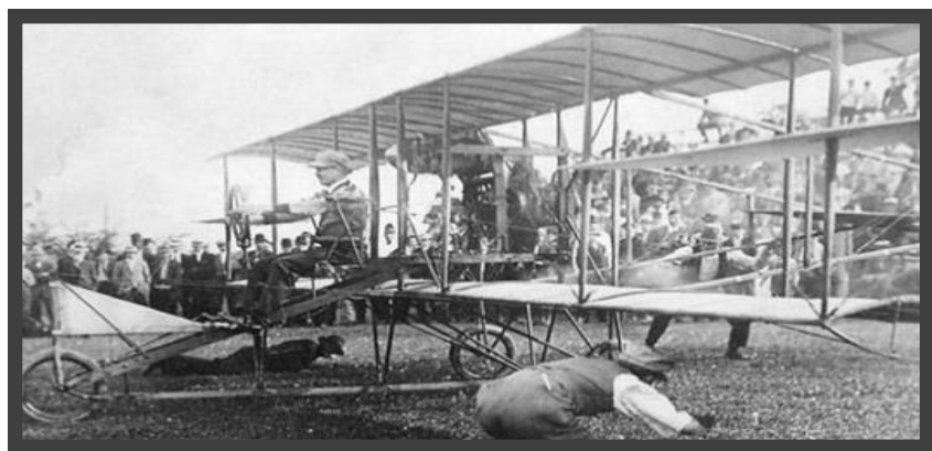
Curtiss Biplane taking off from Hempstead Plains, 1920