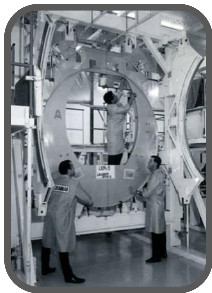
Grumman, Bethpage, Technicians at work on a Lunar Modular