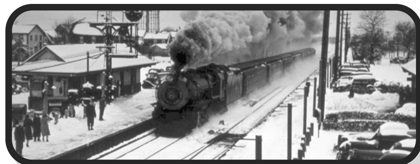
Mineola Train Station, 1940