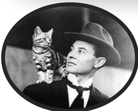
John Bevins Moisant "Captain Kitty", a pioneer United States aviator, was never without his beloved tabby cat, Mademoiselle Fifi.