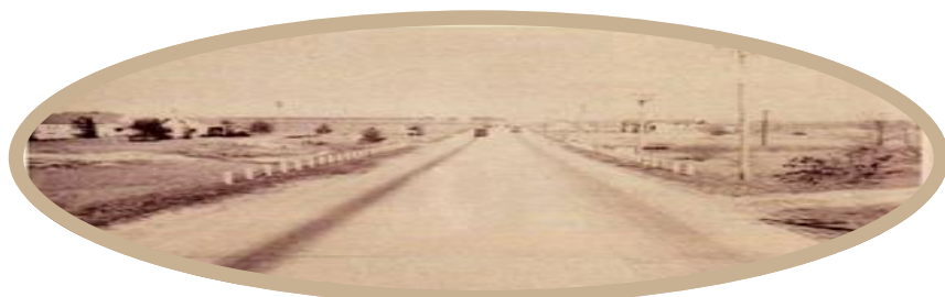
Hempstead Tpke & Loring Rd, Levittown, c.1930s