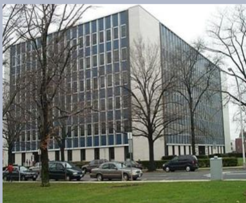
Office of the Nassau County Clerk 240 Old Country Road, Mineola