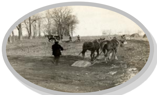
Roads being cleared on the North Shore