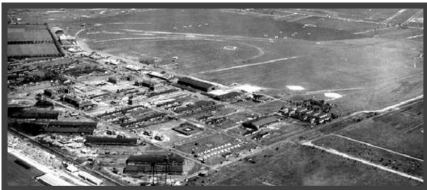
Aerial view of Mitchel Field c.1930