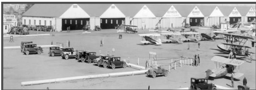
Roosevelt Field, 1928