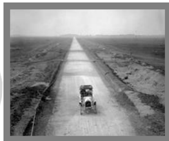
Vanderbilt Cup Race Carman Ave, East Meadow Early 1900s