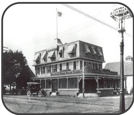
Jericho Tpke & Willis Ave, Mineola, 1920