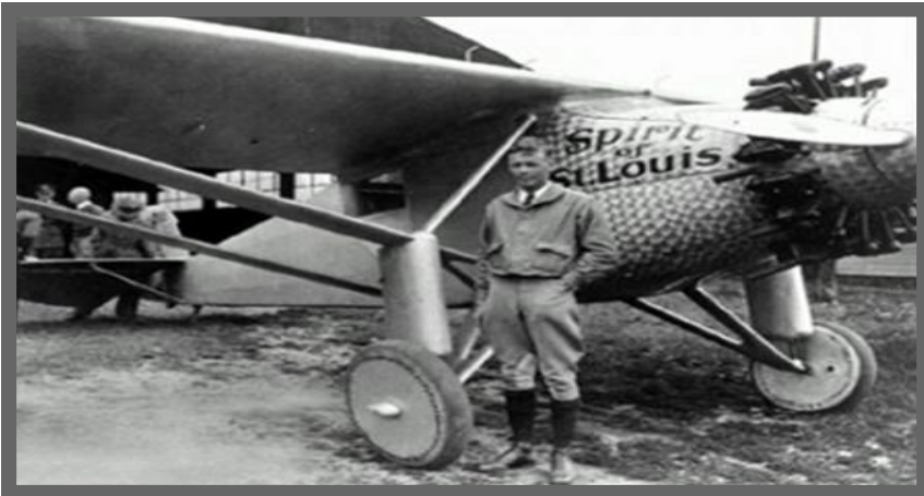
Charles Lindbergh before taking off from Roosevelt Field for his record breaking "Transatlantic Flight", May 20, 1927

The aviation industry grew rapidly in Nassau County during