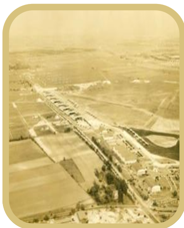
Aerial view of Roosevelt Field c.1931

As commuter villages grew, the sound of engines from above shattered the peace and quiet of the Hempstead Plains. Early airplane pilots soared overhead, testing their craft above this tremendous, flat, open prairie. Spectators gathered at two nationally significant airstrips: Roosevelt Field, a center of civilian aviation, and nearby Mitchel Field, a major army air base.