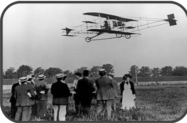
Early days of Aviation at Hempstead Plains

The aviation industry grew rapidly in Nassau County during