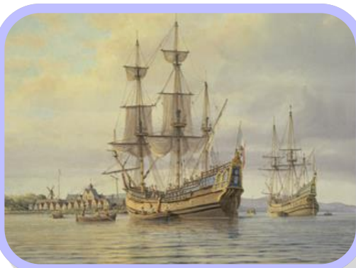
Dutch Settlers, Long Island Sound, c.1600s

Three years later, on December 13, 1643, another band of adventurous New Englanders crossed the Long Island Sound from the Connecticut towns of Wethersfield and Stamford. The colonists landed at