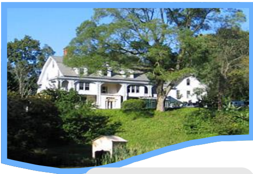
Cedarmere, Roslyn Harbor, Historic property of 19th century poet, William Cullen Bryant

Even before the Civil War, noted editor William C. Bryant established his country estate, Cedarmere, in Roslyn. In 1899, telegraph company tycoon Clarence Mackay built his 650-acre Harborhill complex, also in Roslyn.