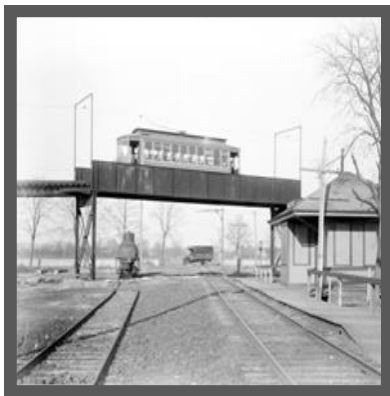
West Hempstead Trolley, area of Hempstead Ave, 1920