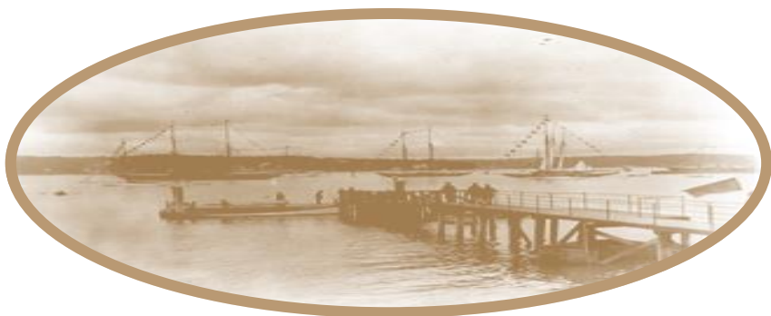
Long Island Sound, Oyster Bay, c.1900s

beautiful seaside. Waterfront communities such as Sea Cliff, founded as a Methodist camp meeting ground, blossomed. The wooded North Shore attracted prominent New Yorkers to establish vacation homes.