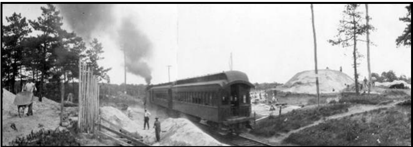
Central Ave Bethpage bridge construction, Vanderbilt Cup Races, 1908

villages along the railroad lines swelled with commuters, leaping from 55,448 in 1900 to 303,053 in 1930.