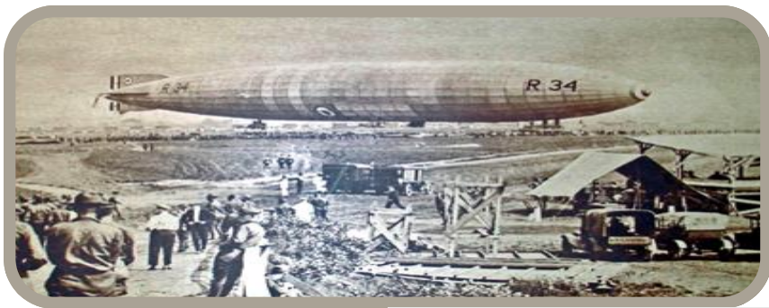
Landing of the first transatlantic airship (R 34) at Roosevelt field, July 1919