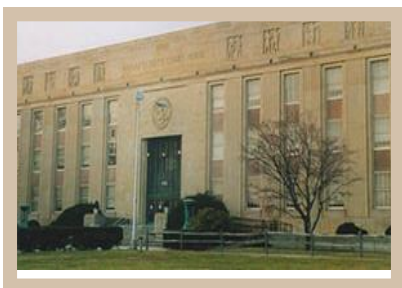
County Court 262 Old Country Rd, Mineola