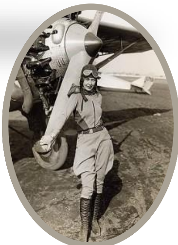
Elinor Smith "Flyer Flapper of Freeport", voted the Best Woman Pilot in the USA, 1930