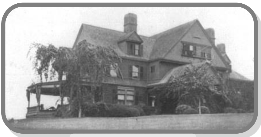
President Roosevelt's home Sagamore Hill, Oyster Bay, c.1902

In 1885, Theodore Roosevelt built Sagamore Hill at Oyster Bay. Roosevelt reveled in Nassau County life, writing, "There could be no healthier place to bring children up." Hundreds of thousands of other Nassau residents have agreed for over a century.