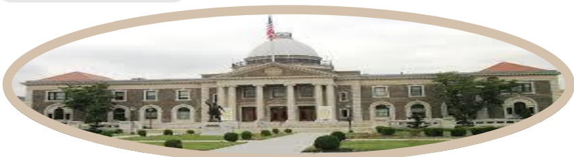
Office of the County Executive 1550 Franklin Ave, Mineola