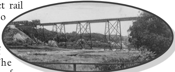
LIRR early years crossing Manhasset Bay

shores of the Island. By the turn of the century, the Long Island Rail Road had become the dominant means of transportation to New York City. In 1911, the railroad completed direct rail service to Pennsylvania Station in the heart of Manhattan. The population of Nassau's small