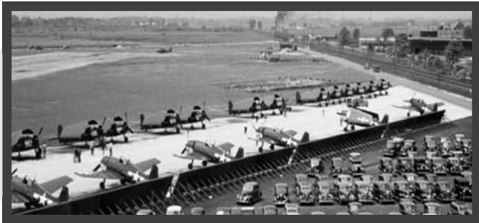
Grumman Bethpage, F6F Hellcats 1945