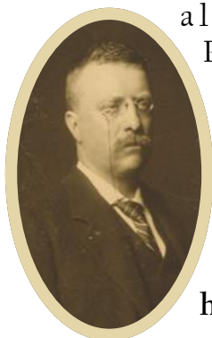
President Theodore Roosevelt, c.1900

In 1885, Theodore Roosevelt built Sagamore Hill at Oyster Bay. Roosevelt reveled in Nassau County life, writing, "There could be no healthier place to bring children up." Hundreds of thousands of other Nassau residents have agreed for over a century.