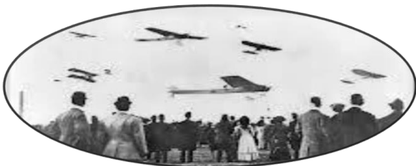
International Aviation Tournament at Belmont Park Racetrack, Wright Brothers attended, 1910