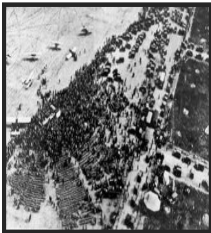
Fitzmaurice Flying Field Massapequa Park, 1929