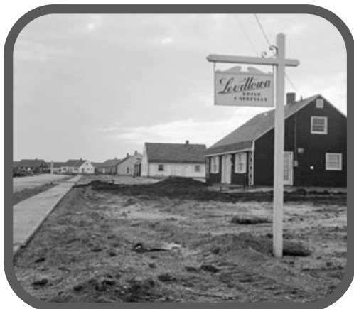
Levittown... in the beginning, c.1947

When the guns of World War II fell silent, the soldiers came home and another wave of settlers transformed Nassau County. An advertisement in Newsday on May 7th, 1947, offered 2,000 homes for $60 a month in a new development built on the open Hempstead plains. By the end of the month, more than 6,500 veterans had filed applications for the new housing units of Levittown.