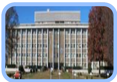
Supreme Court 100 Supreme Court Dr, Mineola