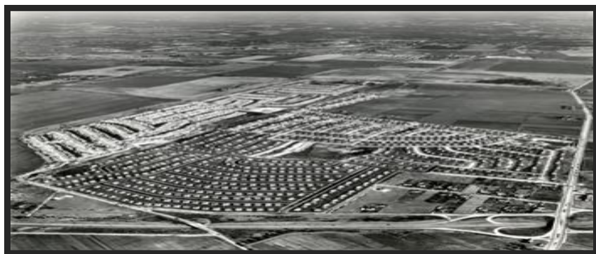
Hempstead Plains, Levittown, 1947