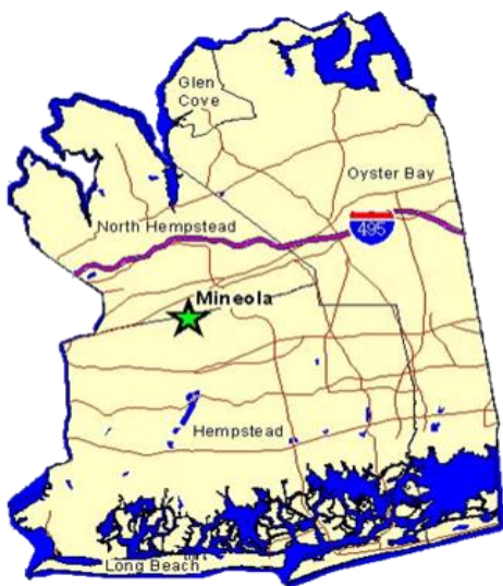
Map of Nassau County, Long Island

On January 22nd of that year, a citizens' meeting in Allen's Hotel in Mineola set the stage for the separation of the three towns by proposing the creation of a new Nassau County. The name was proposed since it reflects the region's earliest Dutch and English colonial heritage, and was used for Long Island as the "Isle of Nassau" honoring William III (1650-1702), who was King of England, Stadholder (governor) of the Netherlands, member of the House of Nassau, and great-grandson of the Prince of Orange. After a bitter battle in Albany, the law creating the new county was signed by Governor Frank S. Black on April 27th, to take effect on January 1st of 1899.