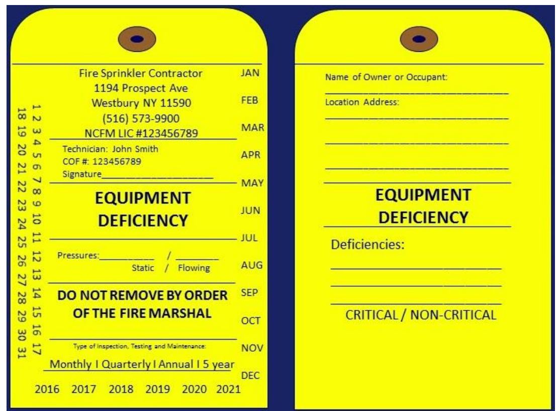
Figure 1.2: A sample of a correct ITM tag for a compliant system with equipment deficiencies.