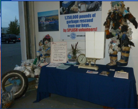
Operation SPLASH display/information center