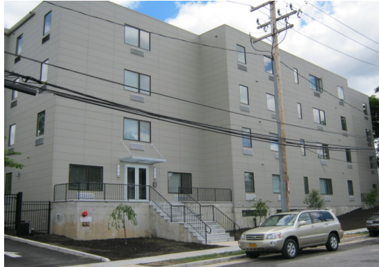
La Cite Development

Redeveloping blighted properties is vital to keep Nassau County moving forward and putting properties on the tax roll. County Executive Mangano awarded $800,000 in HOME funds for the purpose of re-developing abandoned, blighted properties at 479 Front Street in Hempstead known as the La Cite Project (aka Village Lofts). The project consisted of the conversion of four vacant single family homes to a residential building consisting of 29 mixed income rental units. In order to keep construction costs down, the project utilized modular units instead of ground-up construction. As rental units in Nassau County are highly sought after, this building was leased up and occupied quickly.