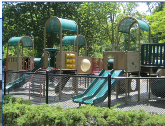
Reverend Arthur Mackey Sr. Park, Roosevelt