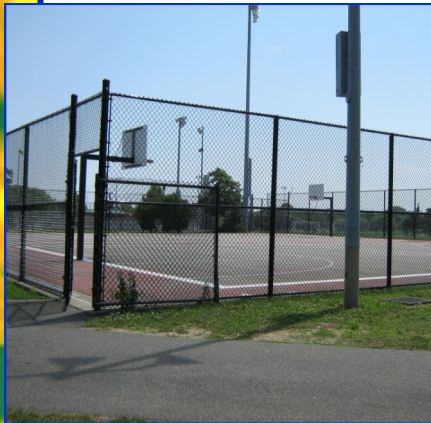
Inwood Park, Inwood