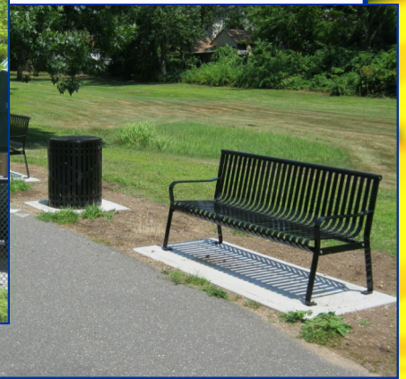
Milburn Creek Park, Freeport

Nassau County parks and playgrounds provide communities with recreational, athletic and social outlets. Nassau County allocated CDBG funds to local parks/playgrounds in Inwood, Roosevelt, Freeport and Levittown. Improvements such as chain-link fencing, replacement of benches, garbage receptacles were one of the many improvements that will entice hundreds of residents to use the park facilities, making it a gathering place for many families.