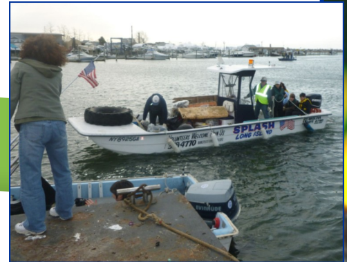
Operation SPLASH boats patrol our local Long Island waterways and pick up trash and debris