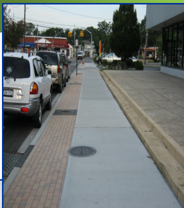
Benkert Street-Before renovation