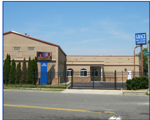
Grace Multi Community Development Corporation – Community Center expanded