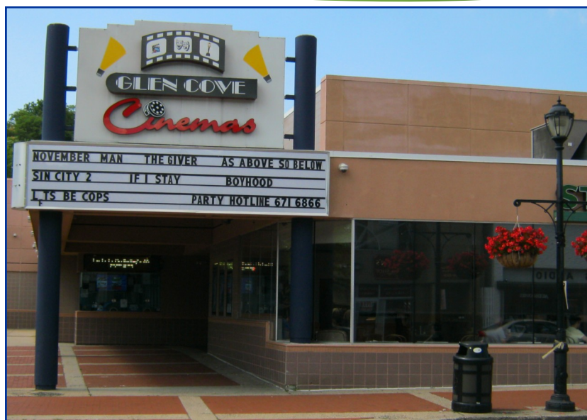
New Glen Cove Cinema