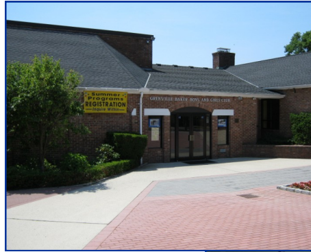
Grenville Baker Boys & Girls Club

On average, the Club welcomes almost two hundred kids through its doors each day, providing a safe place for them to learn, to play and to have fun.