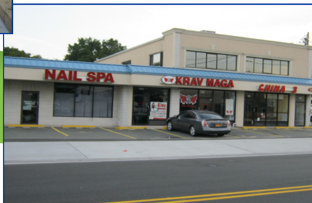
Benkert Street-After renovation

Nassau County Office of Housing & Community Development